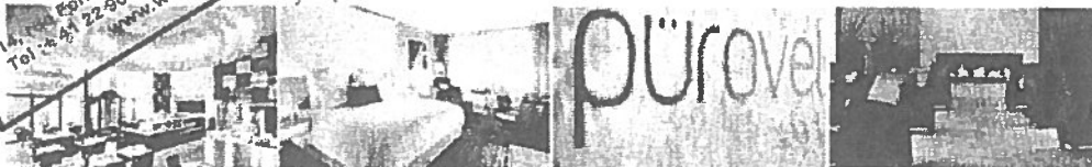
EXHIBIT A: MARKS

CHE-207.765.808 MWST UBS AG Basel • IBAN: CH210023023015124301E